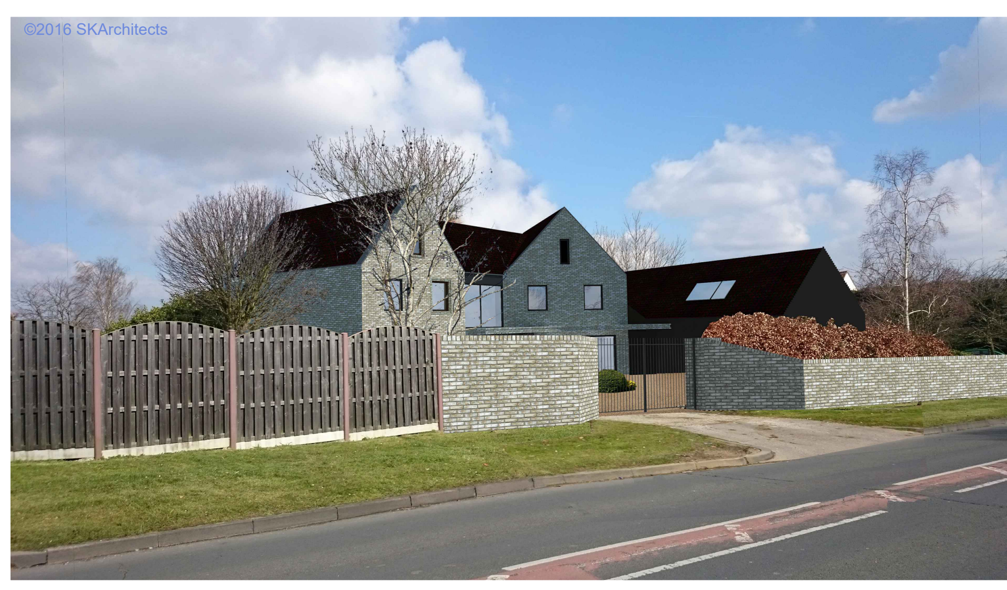
From Left - Winter