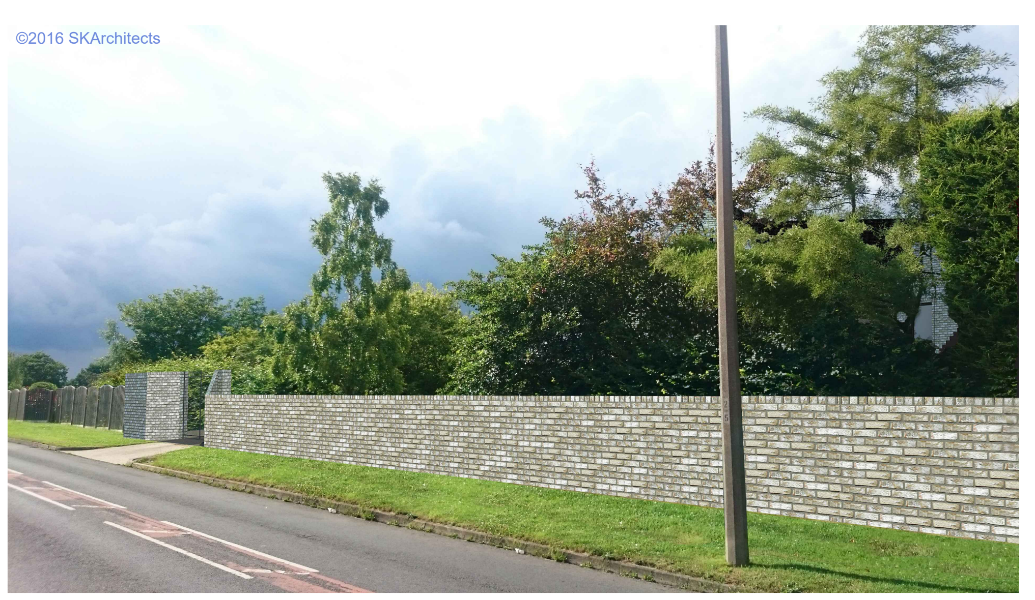
From Right - Summer