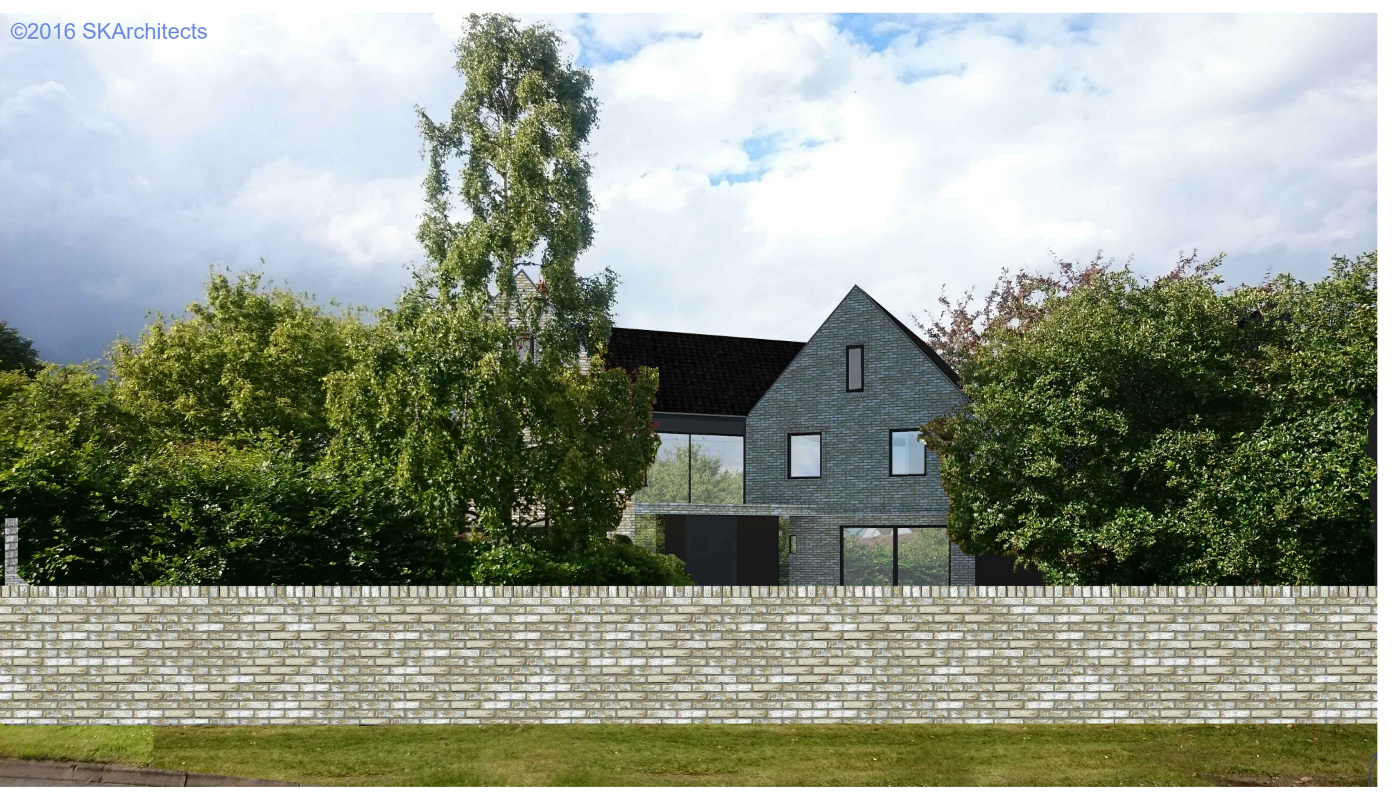
Front View - Summer