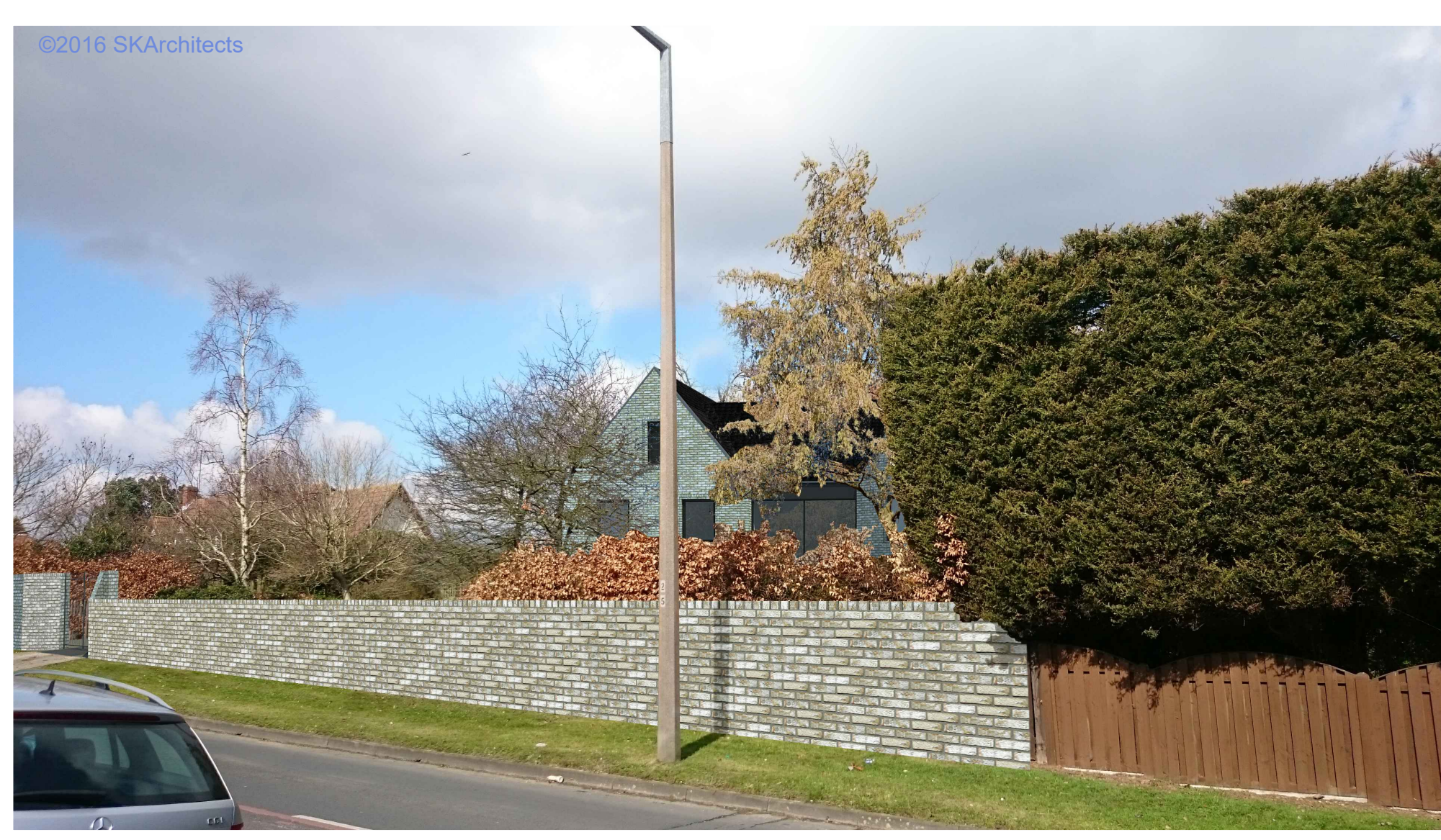
From Right - Winter